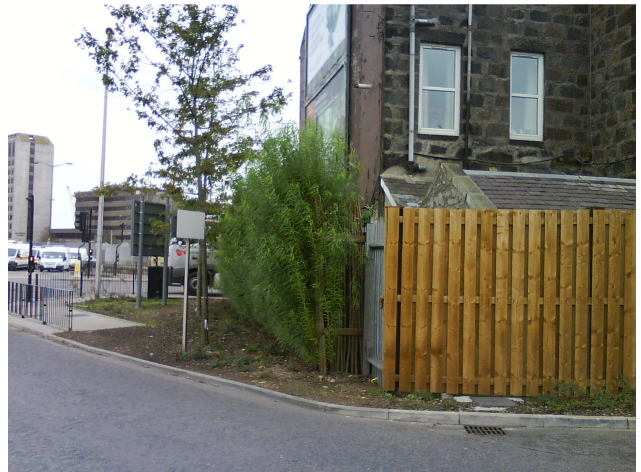
Side view of the Green Barrier™.