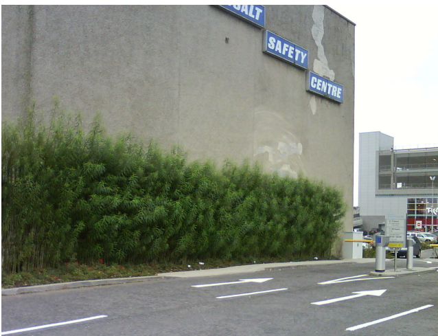
View of the Green Barrier™ only 4 months after installation.