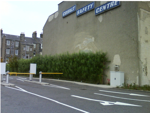
The Green Barrer™ screening off an unsightly building.