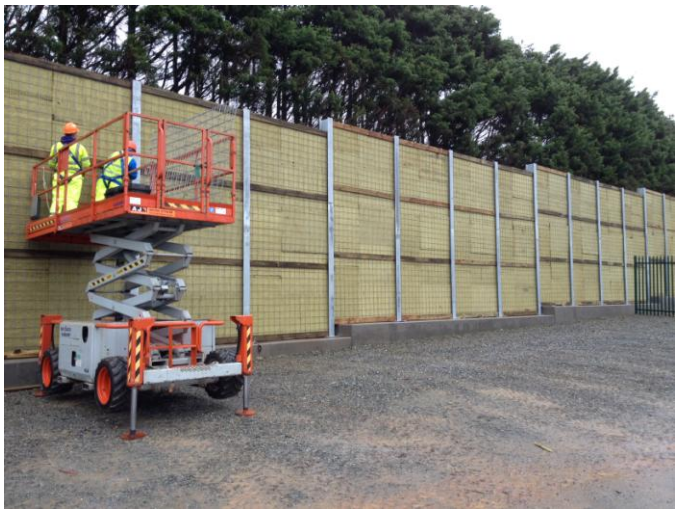
Galvanised mesh being fitted, holding the RockDelta core in position.