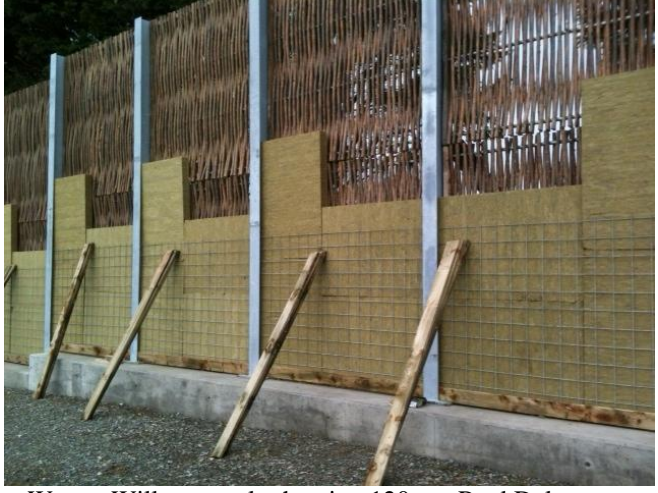
Woven Willow panels showing 120mm RockDelta core.