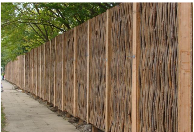
The completed Green Barrier<sup>™</sup> blends in well with the surrounding trees.

With acknowledgement to F. Parkinson Ltd