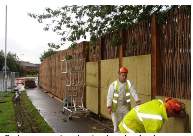
During construction, showing the noise absorbent core inserted between the woven willow panels.